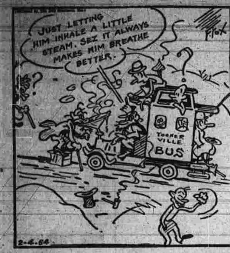
TOONVILLE FOLKS BY FONTAINE FOX FUNNY BUSINESS